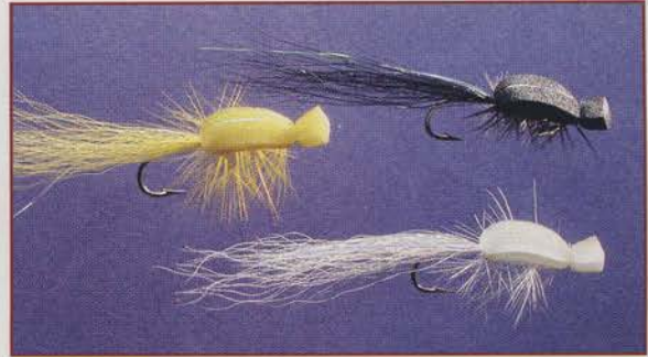
A Gurgler gets its action from the foam lip at the front of the fly. Among the easiest topwater flies to cast, Gurglers appeal to a huge variety of saltwater fish because they imitate many types of bait.

You can make Crease Flies with tapered, elongated heads if you want them to act like sliders, or with flat noses that function more like poppers. Since they have relatively little frontal area, Crease Flies are easy to cast. Fish them slowly, with an occasional pop, or dead-drift one along a current seam.