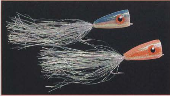
With their big, deeply cupped faces, high poppers make a racket and displace a lot of water. They're good flies for choppy water.