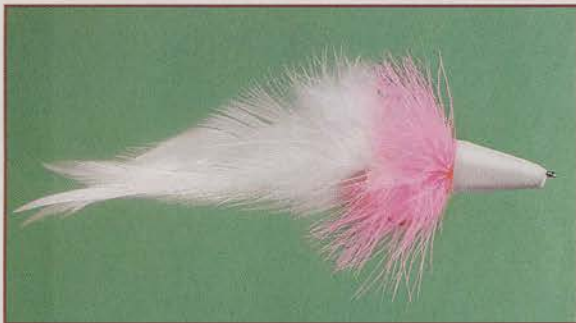
Sliders don't make much noise, but they dart from side to side and up and down. Fish them with an erratic retrieve.

Maybe a fast-sinking line and a big streamer is the best combination for trophy fish, but topwater fishing is hard to beat for sheer fun and excitement. Because surface flies resemble injured baitfish, they provoke some of the most violent strikes from striped bass and bluefish. The fish don't connect on every strike, and that's part of the fun. It's pure magic when a fish gets frustrated by missing an easy meal, and then comes back and smokes your fly.