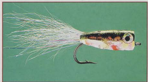
Crease flies are easy to cast and very effective on many species. They work well with a variety of retrieves, and even when dead-drifted.