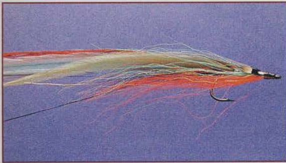
A Flatwing streamer hangs just below the surface and undulates with the slightest current. The patterns are proven big-fish flies.