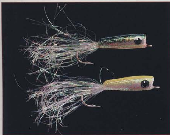
Low poppers represent slender baitfish. They're relatively easy to cast and good choices on calm days or in shallow water.

DEER-HAIR STREAMERS. Eric Leiser's Angus, Lou Tabory's Snake Fly, and many of Bill Catherwood's Giant Killer series have spun deer-hair heads. These flies sit just below the water's surface, and when retrieved they push a lot of water. Fished on a floating line, a deer-hair streamer can even make a wake on the surface. Tied in a variety of sizes and colors, deer-hair streamers imitate both big and small baitfish, and they catch fish under many conditions.