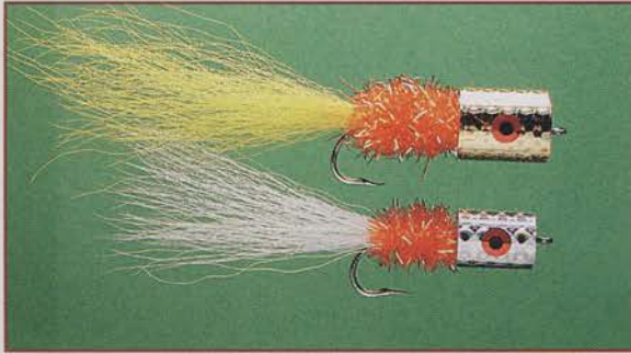
Because they ride low in the water, Bangers hook fish very well. Anglers who tie their own flies can make Bangers with interchangeable heads so you can switch sizes while fishing.