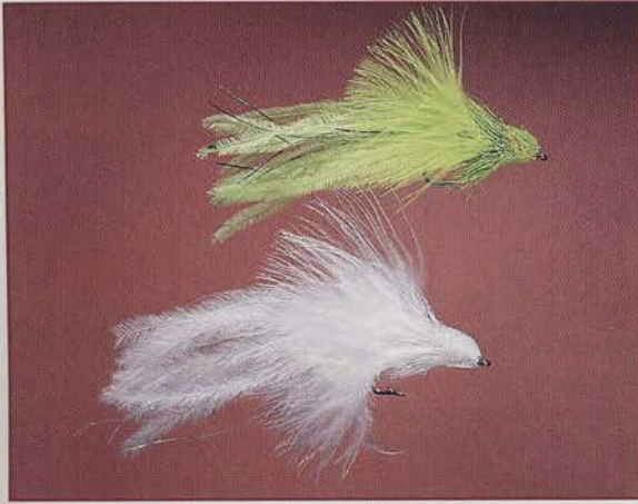
Deer-hair streamers push a lot of water and appeal to most saltwater gamefish species. You can fish them on floating or sinking lines, with fast or slow retrieves, and in nearly any kind of water.