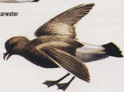
Wilson's Storm Petrel